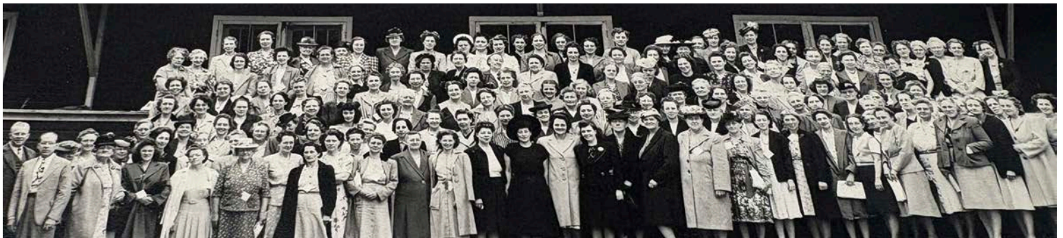
This photo was taken at Camp Okoboji. Does anyone know when? Does anyone recognize anyone?