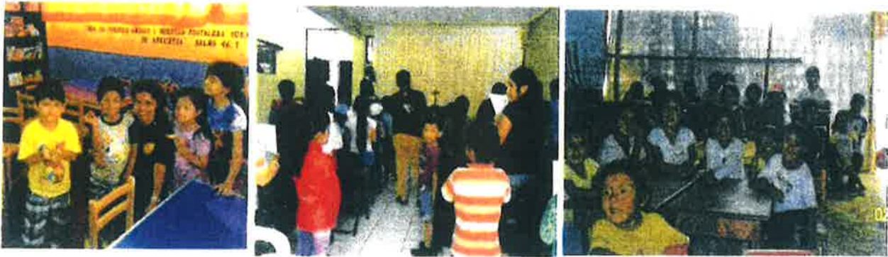
Little children taught about Jesus! 24 people going to be members of new church! 130 little children receive a healthy meal!

FEEDING LITTLE CHILDREN & TELLING THEM OF JESUS