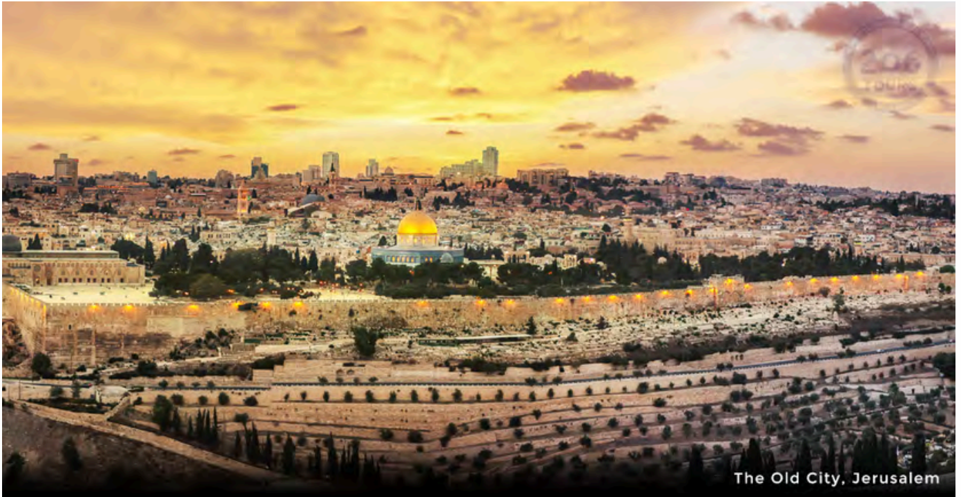
The Old City, Jerusalem